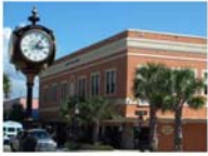
Circa 1889 Leesburg Opera House

2,150 SF in Shared Common areas Hallways, Elevator / Stairwell , Bathrooms, Kitchen, Closet / Utility Room