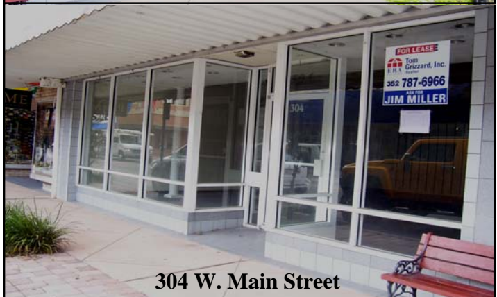
304 W. Main Street