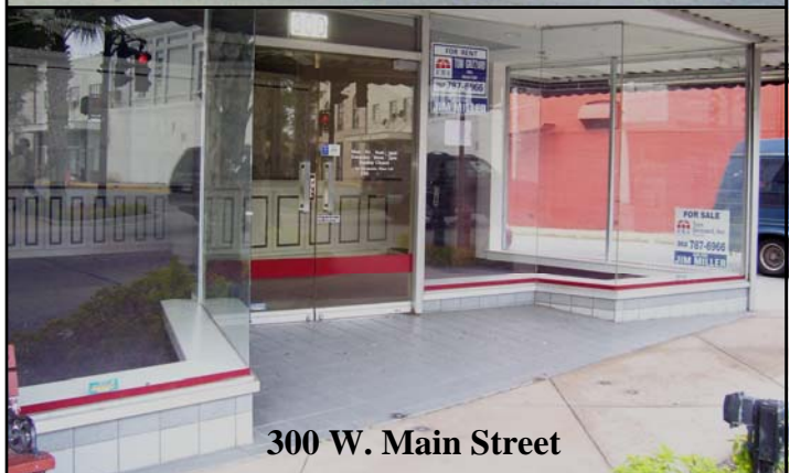
300 W. Main Street

Bldg #300 $1,500 / $8.57 per sf NNN. Bldg #304 $1,350 / $7.71 per sf NNN.